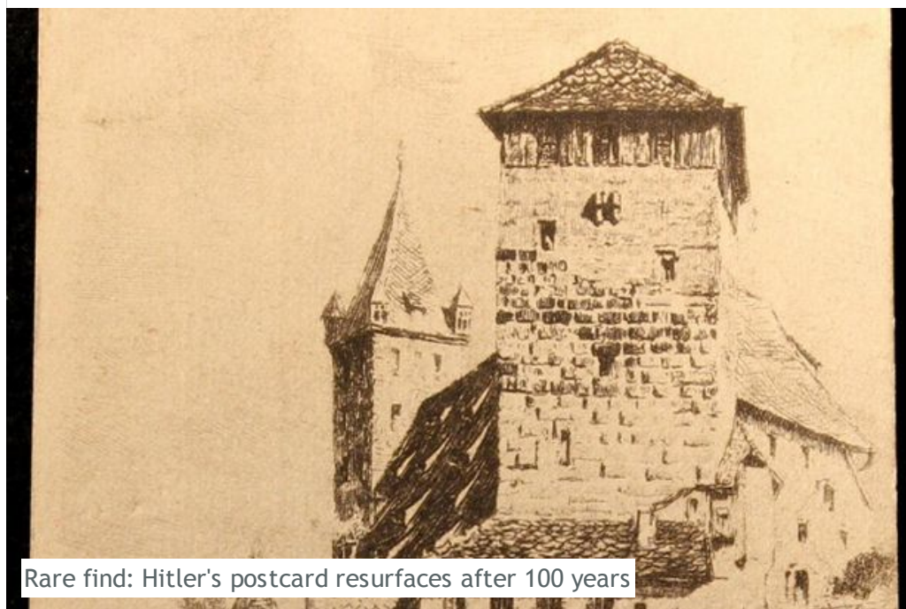
Rare find: Hitler's postcard resurfaces after 100 years