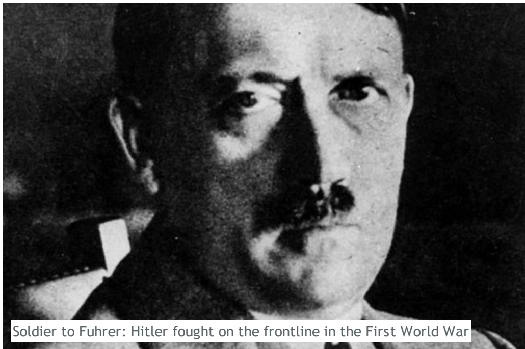
Soldier to Fuhrer: Hitler fought on the frontline in the First World War